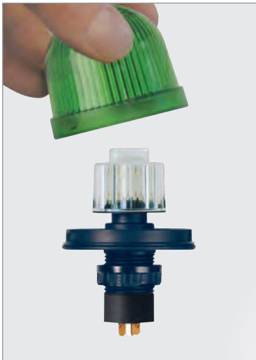
Bulb change via removal of lens (LED bulb as accessory)